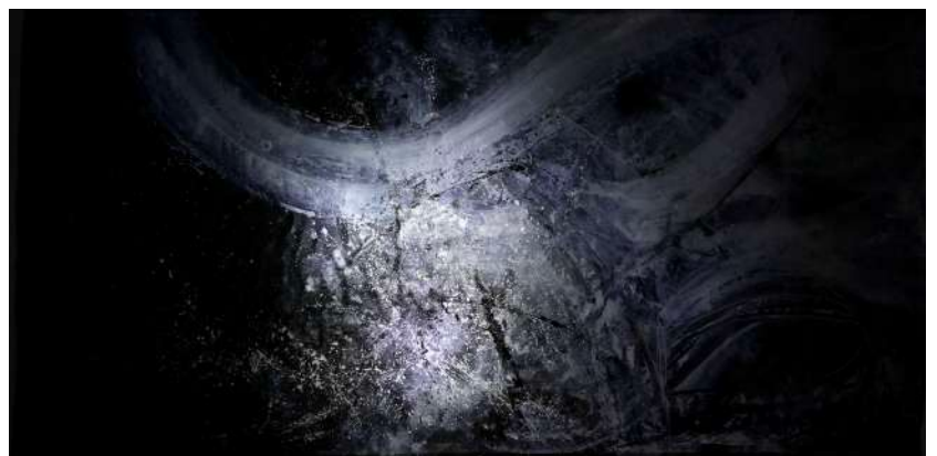
Fluctuation of Time - From a closed space- (2024) 148 x 294 cm