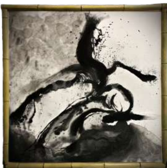
From top Space Time Diagram (2024) Mother Earth (2024) 41,5 x 32 x 4 cm Raison d'être (2022) 104 x 104 cm [Bamboo]