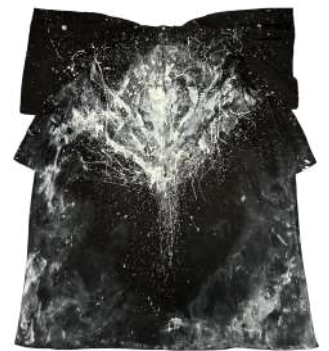
Liberation (2023) [Morning dress]